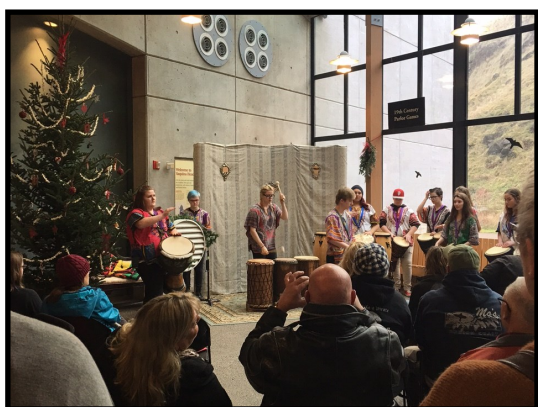
Guests enjoying a spectacular performance by the African Drummers of Eddyville Charter School

FOYL staff and family were pleased to once again participate in the annual Victorian Holiday event held at Yaquina Head on December the 10th. In addition to musical presentations, the day's activities included storytelling, tree decorating and the making of Victorian-era crafts. Yaquina Head staff counted over 385 visitors, many of whom shopped in the Interpretive Store for that special holiday gift (at a holiday discount!). Thank you to all who participated and helped to make this event a resounding success.