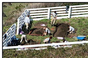
Left: Americorps volunteers prepare beds for the Yaquina Head Lighthouse's Historic Lightkeeper's Garden.

Restoration of the Yaquina Head lighthouse keeper's garden is underway thanks to grants from the Siletz Tribal Charitable Contribution Fund and the Oregon Cultural Trust. In early March, a crew of Americorps volunteers began the project by removing noxious weeds, relocating daffodils, and prepping the area for garden beds. Soon Eddyville students will begin the process of planting seeds for the garden. At its completion the garden will provide a historic representation of crops that fed the lighthouse keeper's family at the turn of the century.