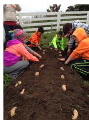
Right: Elementary students from the Eddyville Charter School plant seed potatoes in the prepared beds.