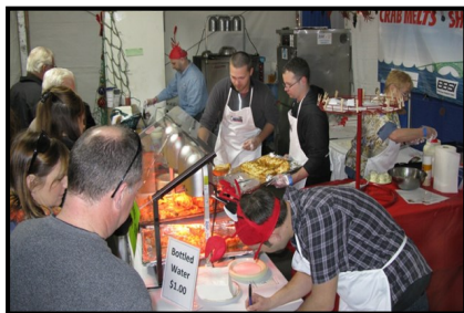
Volunteers and board members staff the food booth at the Seafood and Wine Festival.

This was our first year staffing a food booth at the Seafood and Wine Festival – and we survived!!!