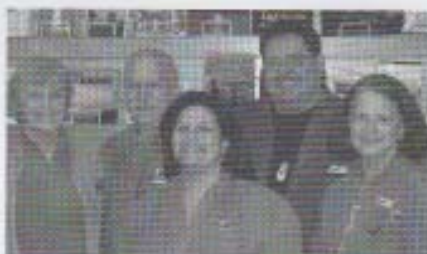
FOYL Store Staff